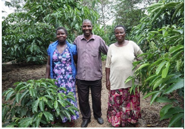
Figure 1: Coffee garden before GREAN project, taken by Elias in June 2017