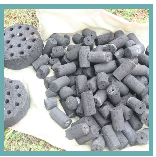
Briquettes from new machines ready for sale