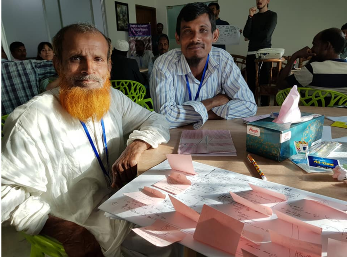
Farmer to Factory Jute Supply Chain workshop and training