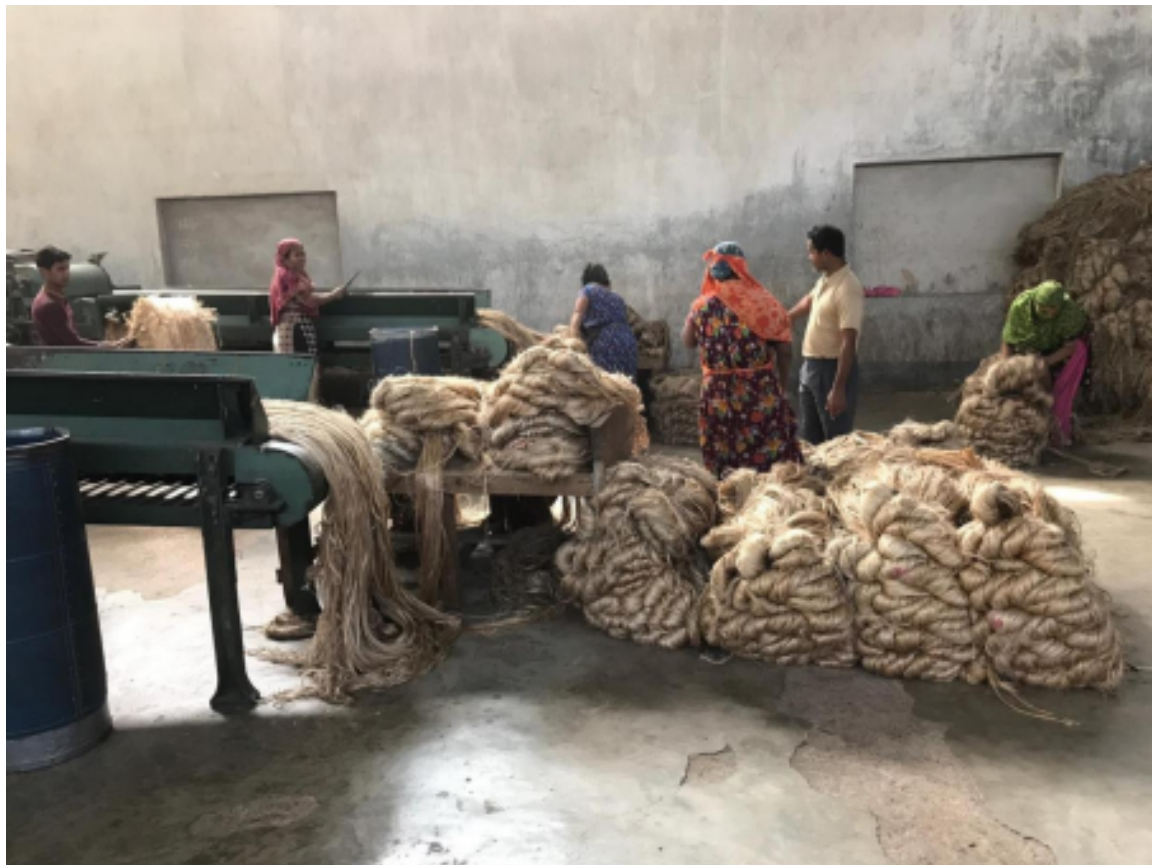
Jute yarn processing at Razzaque Jute Industries Ltd factory