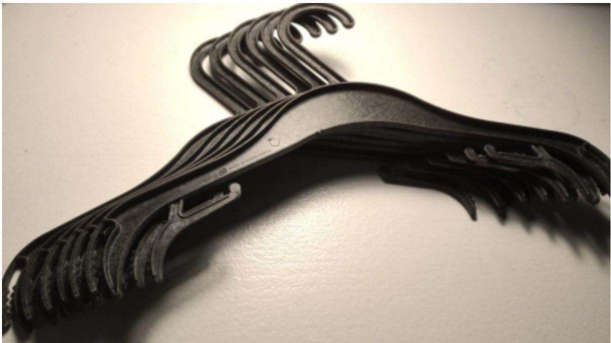
JutePP® hanger prototypes produced by the Joint Venture