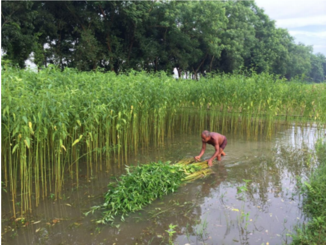
Jute farmer harvesting jute crops