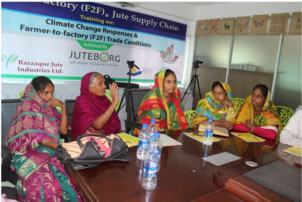
Farmer to Factory Jute Supply Chain workshop and training