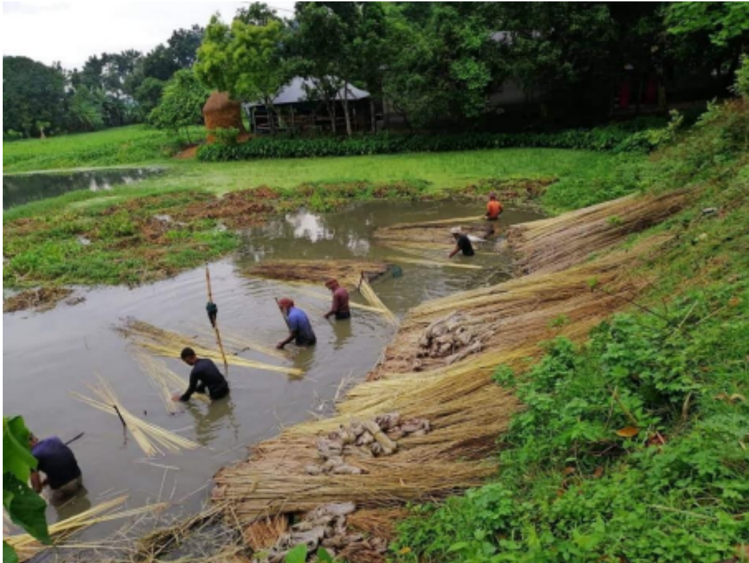
Jute farmers retting jute crops