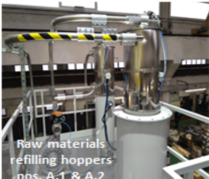
The Extruder Machine.