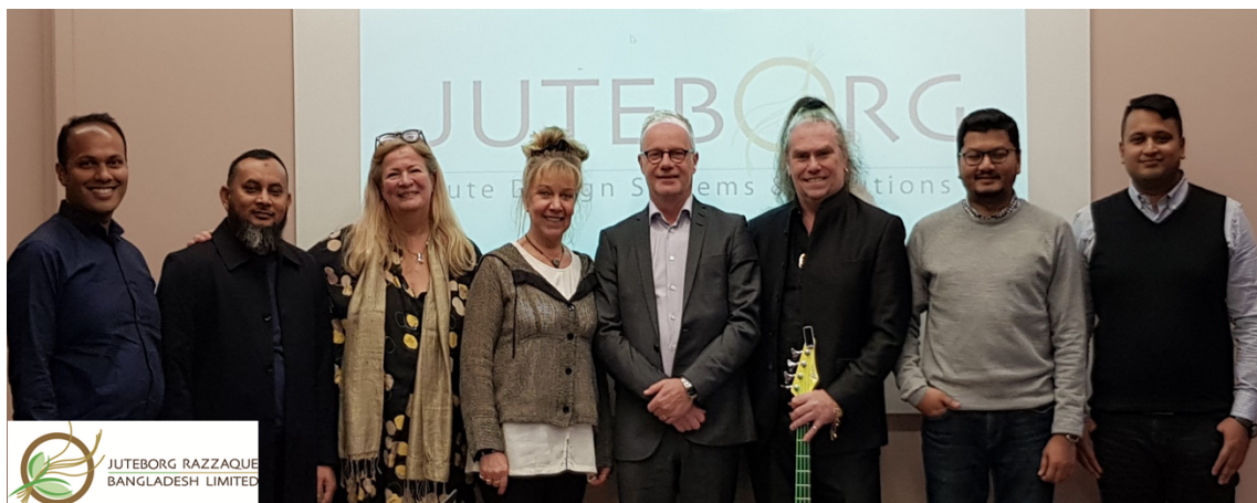
Signing the Joint Venture Company Agreement, Juteborg Razzaque Jute Industry Ltd, Nov 2019.