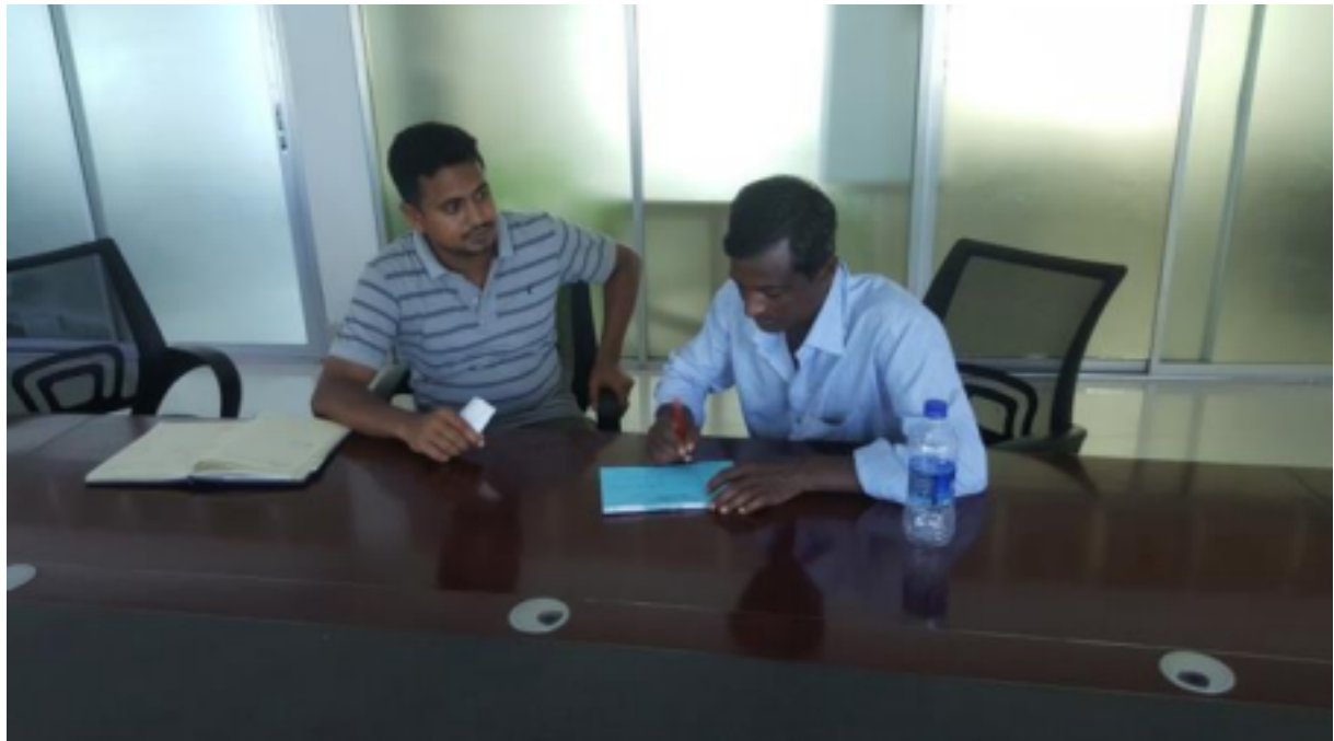
Farmer signing the Memorandum of Understanding as part of the Farmer to Factory model