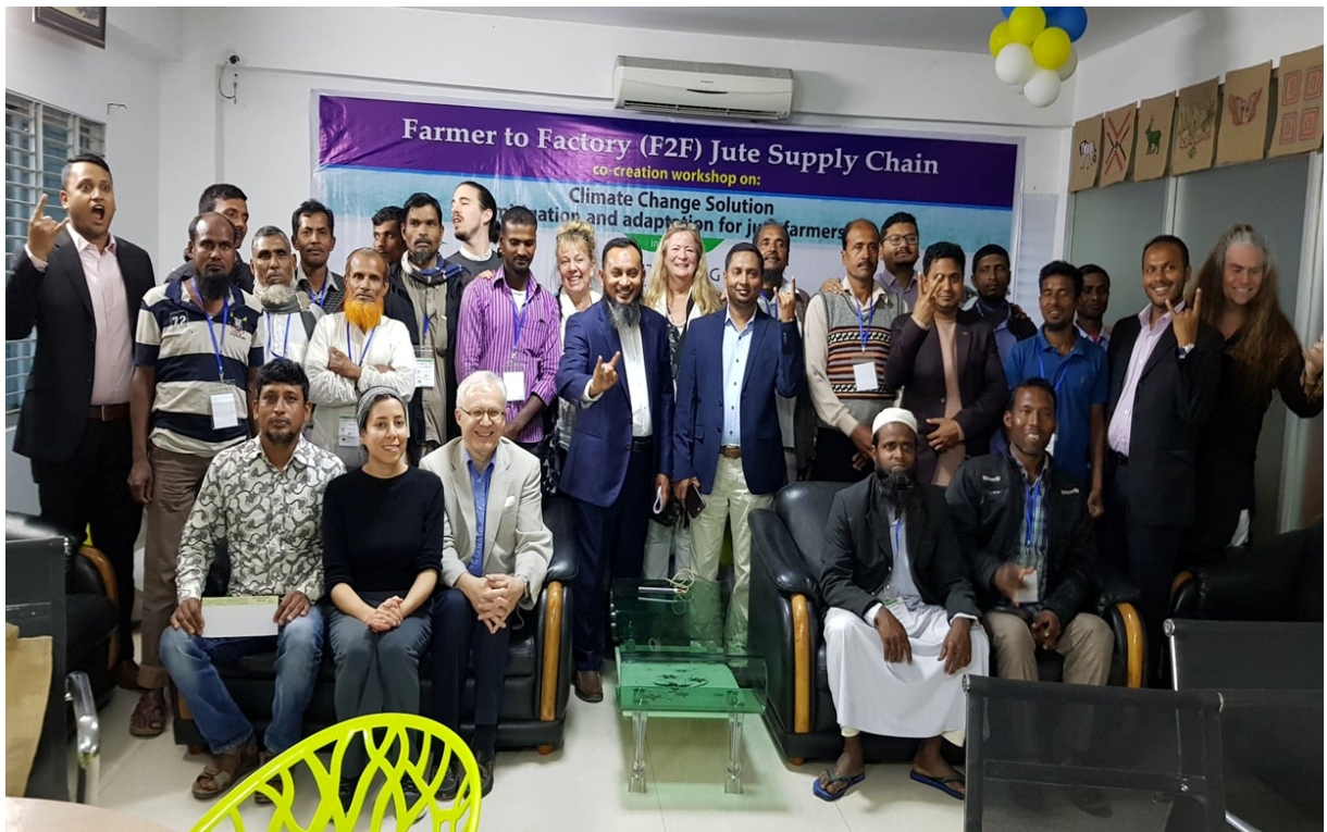
Participants of the Farmer to Factory Jute Supply Chain workshop and training