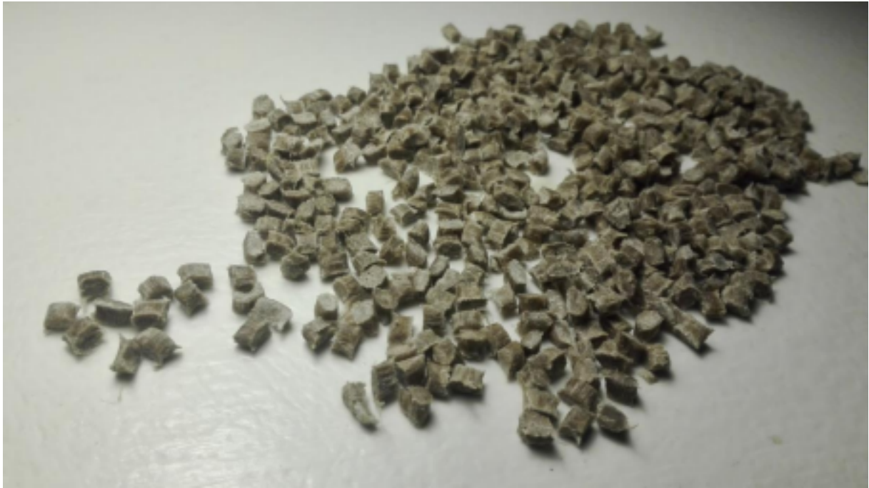
JutePP® granule prototype produced by the Joint Venture