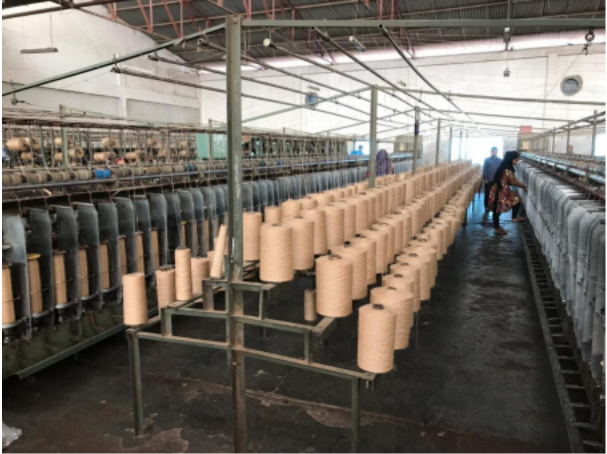
Jute yarn production at Razzaque Jute Industries Ltd factory